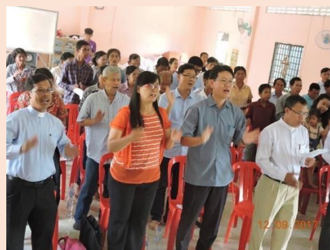
The Certificate of Ministry for Lay Leaders in Svay Rieng – Sept. 14