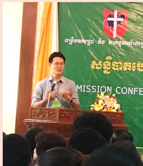
The 9 th Mission Conference of Methodist Church in Cambodia – Sept. 6-8