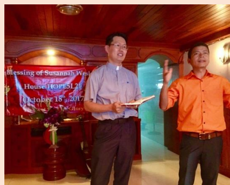
Blessing of Susanna Wesley Dormitory in Phnom Penh – Oct. 18