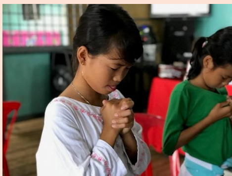
Visited Water Village and worshiped at a Vietnamese church. They have big Vietnamese population but only one church is present. Please pray for the Good News to reach the people in this area - Oct.21-22