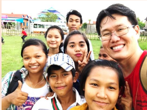
Visited Local Methodist Churches in Kampong Thom - Sep.14-17