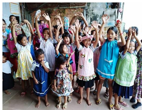
AFTON MT. WOMAN GROUP SEND PILLOW CASE DRESSES

Finally, thank you for your prayers and support. May you find hope renewed, health restored and love abides with you always. May the Spirit of God. Dwell in your homes and families.