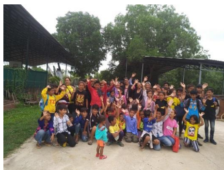
CHILDREN FIELD TRIP

Street Children Ministry Advance No # 14921A