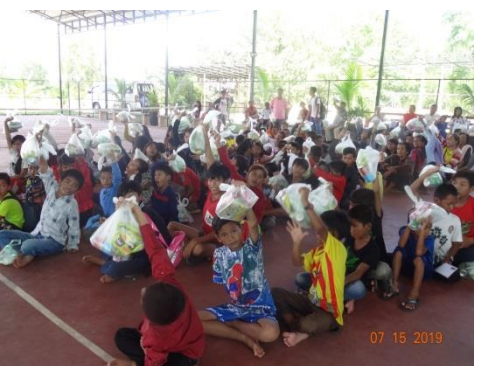
Children get lunch box