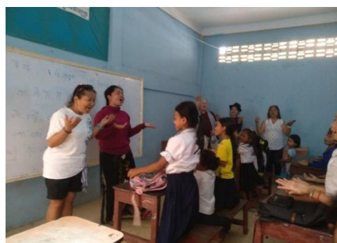
Students learn singing song