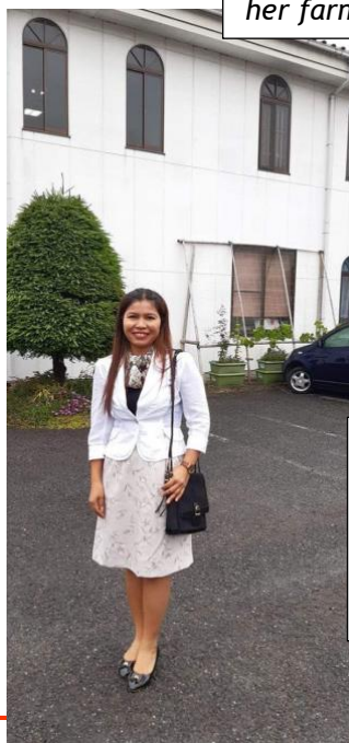
She was trained at ARI (Asian Rural Institute) in Japan. And willing and ready to share her new knowledge to her women constituents.